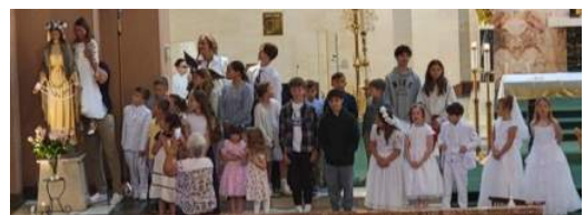
FIRST COMMUNION & FAMILY CATECHESIS CLASSES