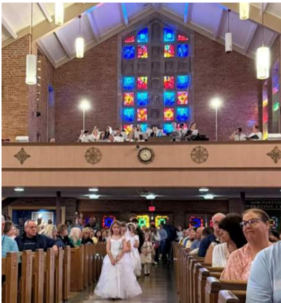
CHILDREN'S CHOIR IN BALCONY