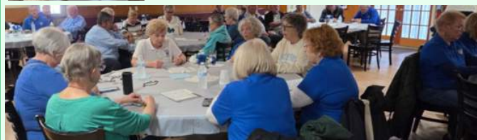
Praying the Rosary together before the Crowning