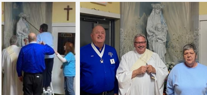
PHOTOS ABOVE ARE FROM THIS YEAR'S ANNUAL MAY CROWNING OF OUR COUNCIL PATRON, OUR LADY OF THE ROSARY